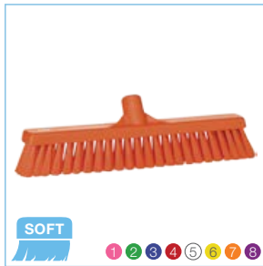
3179x Vikan 16" Small Particle Push Broom