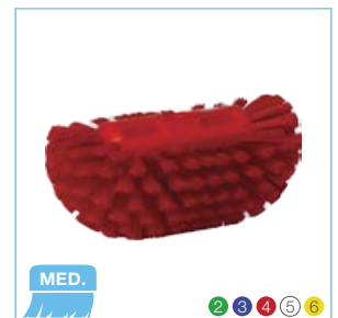
7039x Vikan Tank Brush