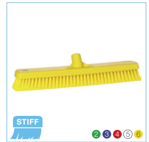
7062x Vikan 19" Deck Scrub