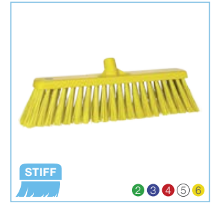
2920x Vikan 20" Push Broom