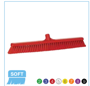
3199x Vikan 24" Small Particle Push Broom