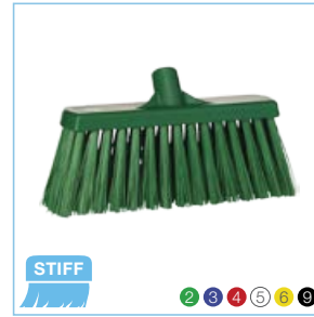
2915x Vikan 13" Push Broom