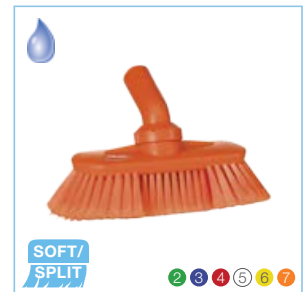
7067x Vikan Waterfed Washing Brush w/Angle Adjustment