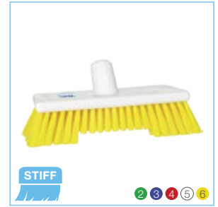
7044x Vikan Narrow Flared Deck Scrub