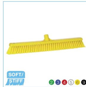
3194x Vikan 24" Combo Push Broom