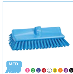
7047x Vikan High-Low Brush