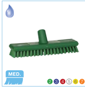
7041x Vikan Deck Scrub