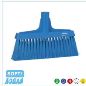
3104x Vikan 10" Upright Broom