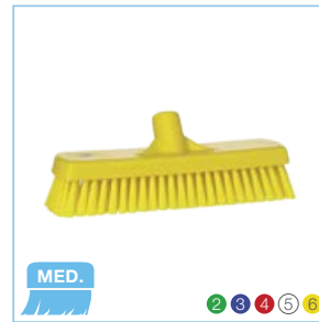
7061x Vikan 12" Deck Scrub