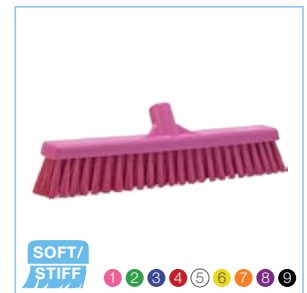
3174x Vikan 16" Combo Push Broom