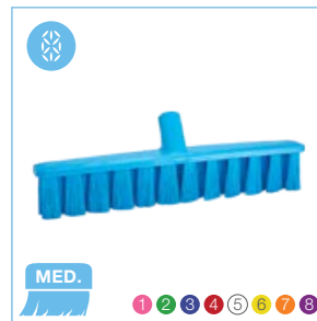
3173x Vikan 16" UST Push Broom