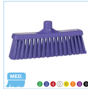
3166x Vikan 12" Upright Broom