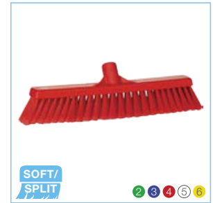
3178x Vikan 16" Fine Particle Push Broom