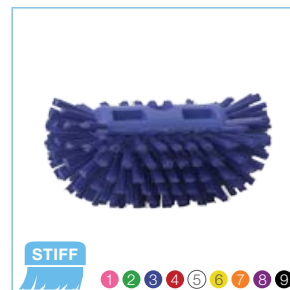
7037x Vikan Tank Brush