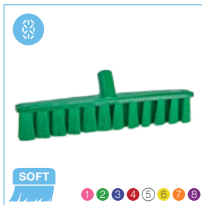
3171x Vikan 16" UST Push Broom