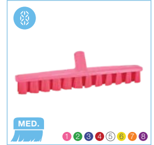
7064x Vikan 16" UST Deck Scrub