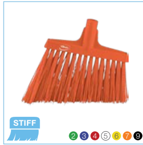
2914x Vikan Angle Broom