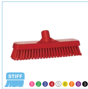
7060x Vikan 12" Deck Scrub