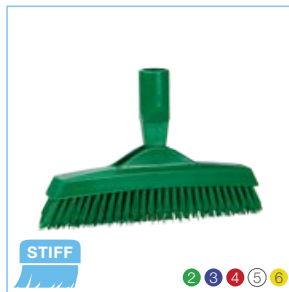
7040x Vikan Grout Brush