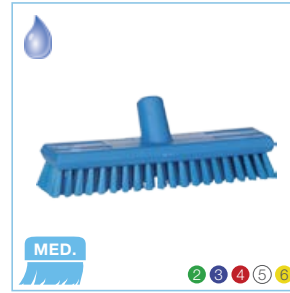
7043x Vikan Deck Scrub