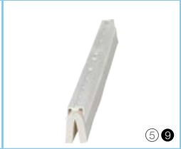
7774x 24" Replacement Cassette