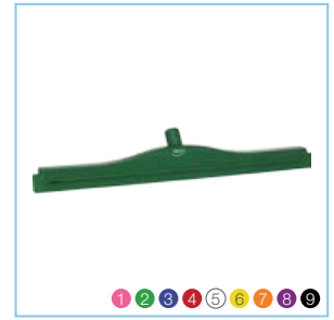
7714x 24" Double Blade Ultra Hygiene Squeegee