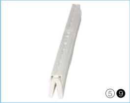
7775x 28" Replacement Cassette