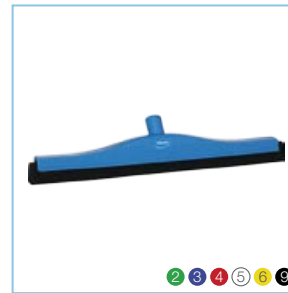
7753x 20" Fixed Head Squeegee