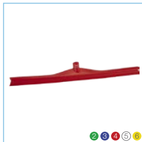
7170x 28" Ultra Hygiene Squeegee