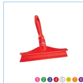
7125x 10" Ultra Hygiene Bench Squeegee