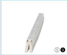
7773x 20" Replacement Cassette