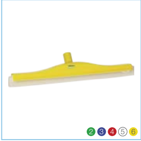
7763x 20" Swivel Neck Squeegee