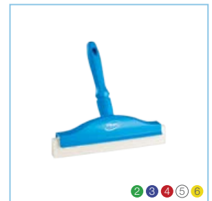
7751x 10" Fixed Head Bench Squeegee