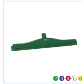
7713x 20" Double Blade Ultra Hygiene Squeegee