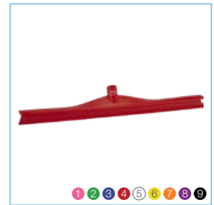
7160x 24" Ultra Hygiene Squeegee