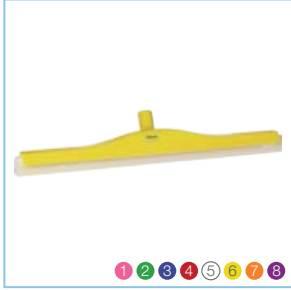
7764x 24" Swivel Neck Squeegee