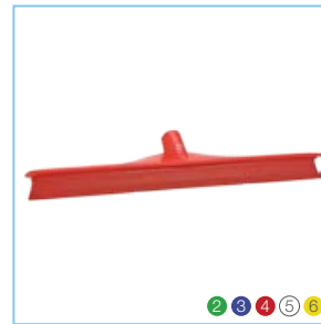
7150x 20" Ultra Hygiene Squeegee