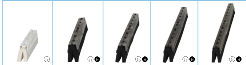
7771x 10" Replacement Bench Cassette 7772x 16" Replacement Cassette 7773x 20" Replacement Cassette 7774x 24" Replacement Cassette 7775x 28" Replacement Cassette