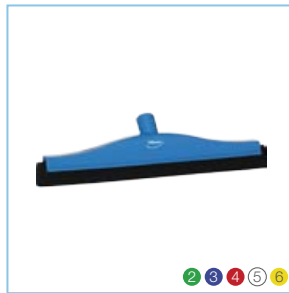
7752x 16" Fixed Head Squeegee