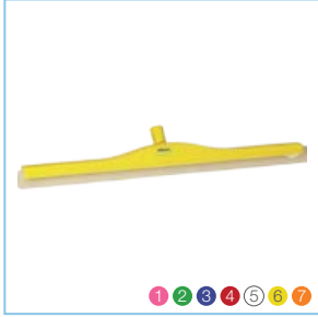
7765x 28" Swivel Neck Squeegee