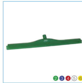
7715x 28" Double Blade Ultra Hygiene Squeegee