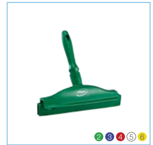
7711x 10" Double Blade Ultra Hygiene Bench Squeegee