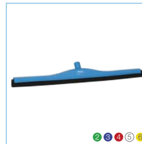
7755x 28" Fixed Head Squeegee