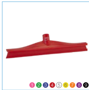
7140x 16" Ultra Hygiene Squeegee