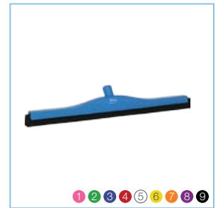
7754x 24" Fixed Head Squeegee