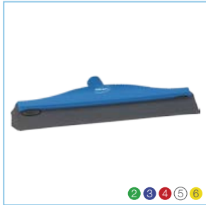
7716x Ceiling Squeegee