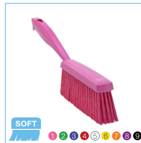
4587x Fine-Particle Bench Brush