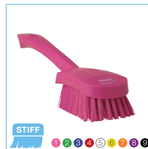
4192x Short-Handled Scrubbing Brush