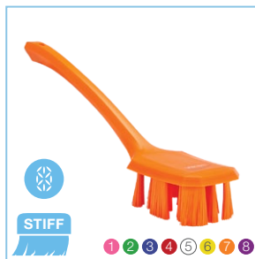
4196x UST Long-Handled Hand Brush