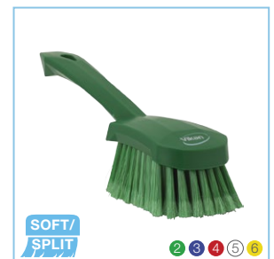
4194x Short-Handled Washing Brush