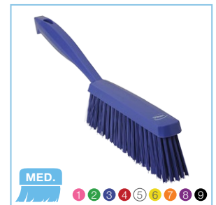
4589x Large-Particle Bench Brush