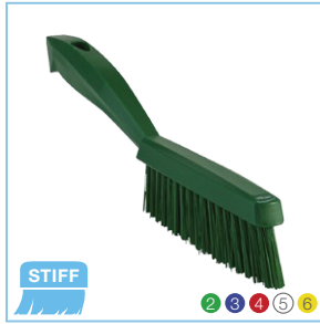
4195x Narrow Hand Brush