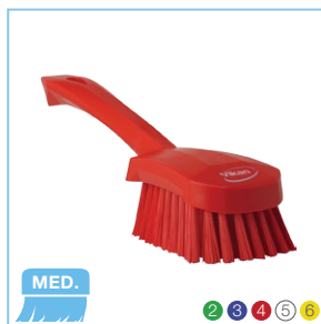
4190x Short-Handled Brush