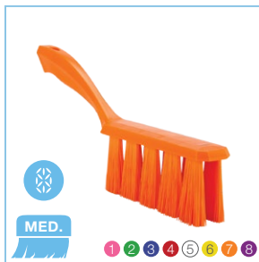
4585x UST Medium Bench Brush