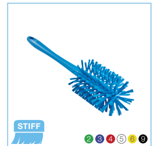
5381-90-x Bottle Brush