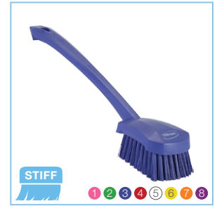
4186x Heavy-Duty Long-Handled Hand Brush