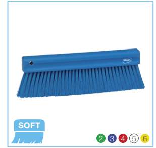
4582x Fine-Particle Counter Brush