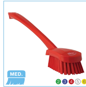
4182x Long-Handled Scrubbing Brush