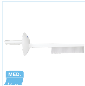
41845 Brush with Hand Guard