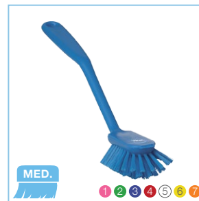
4237x Dish Brush with Scraper