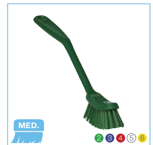
4287x Narrow Dish Brush