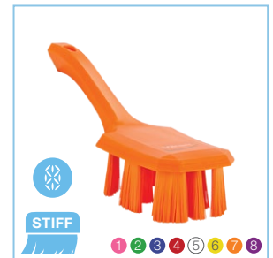
4179x UST Short-Handled Hand Brush