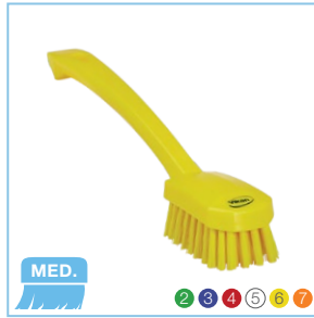
3088x Utility Brush