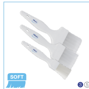
555030x, 555050x, 555070x Pastry Brushes