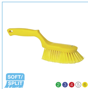
4167x Raised-Handle Washing Brush