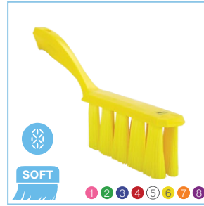
4581x UST Soft Bench Brush