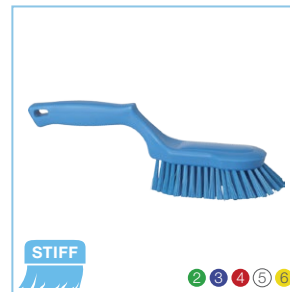
4169x Raised-Handle Scrubbing Brush